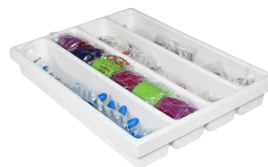
PN: 50975 4 Compartment