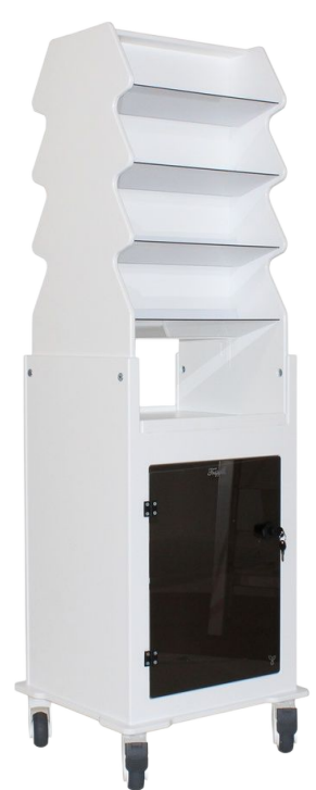
PN: 54056 Smoked Door