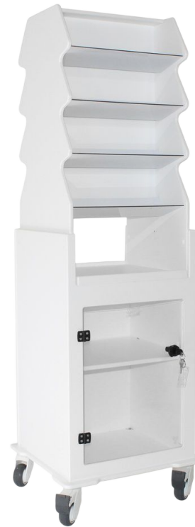
PN: 53972 Clear Door