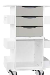
PN: 53481 Dolphin Gray