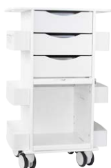
PN: 53370 White