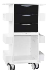
PN: 53382 Black