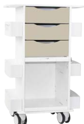
PN: 5337 Almond Beige