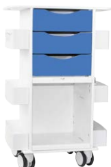
PN: 53375 Global Blue