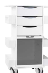
PN: 53563 Smoked Door