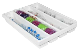
PN: 50975 4 Compartment