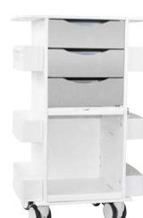
PN: 53372 Silver Metallic