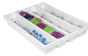
PN: 50975 4 Compartment