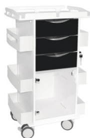
PN: 53541 Black