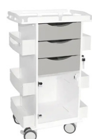
PN: 53590 Dolphin Gray