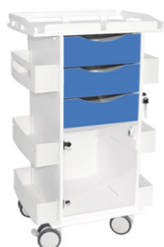
PN: 53534 Global Blue