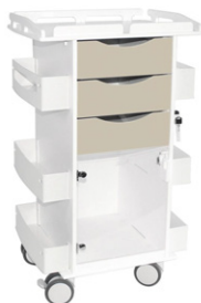
PN: 53530 Almond Beige