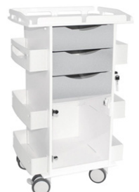
PN: 53531 Silver Metallic