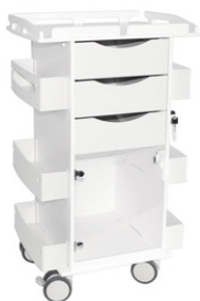
PN: 53547 White