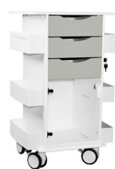
PN: 53588 Dolphin Gray