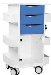
PN: 53522 Global Blue