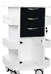
PN: 53529 Black