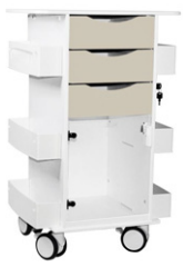
PN: 53518 Almond Beige