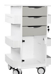
PN: 53519 Silver Metallic