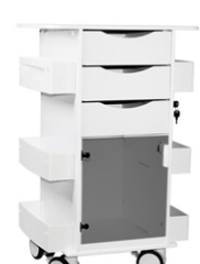
PN: 53562 Smoked Door