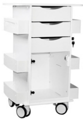
PN: 53517 White