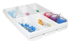
PN: 50974 6 Compartment