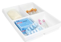
PN: 50917 4 Compartment