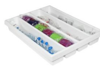
PN: 50975 4 Compartment