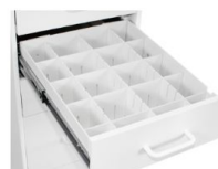
PN: 51998 Adjustable