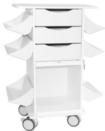
PN: 53490 White