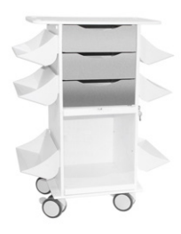
PN: 53492 Silver Metallic