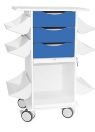
PN: 53495 Global Blue