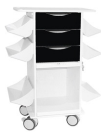
PN: 53501 Black