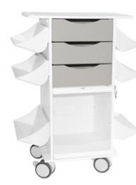
PN: 53592 Dolphin Gray