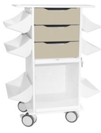
PN: 53491 Almond Beige