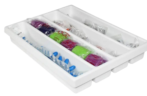
PN: 50975 4 Compartment