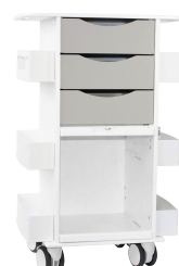
PN: 53481 Dolphin Gray