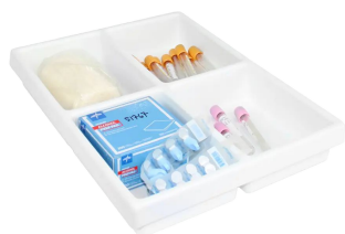
PN: 50917 4 Compartment