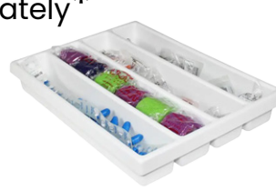
PN: 50975 4 Compartment