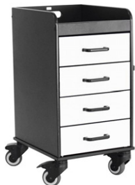
PN: 53426 White