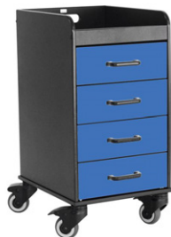
PN: 53427 Global Blue