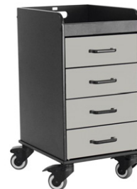
PN: 53480 Dolphin Gray