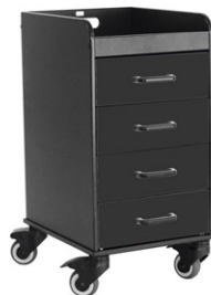
PN: 53436 Black