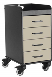
PN: 53434 Almond Beige