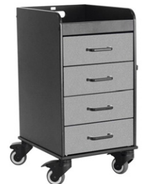
PN: 53435 Silver Metallic