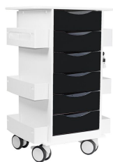
PN: 53474 Black