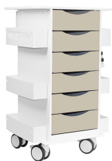
PN: 53464 Almond Beige