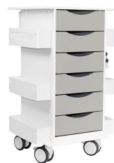
PN: 53478 Dolphin Gray