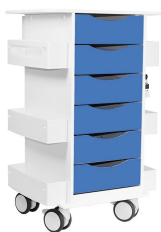
PN: 53468 Global Blue