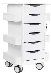
PN: 53463 White