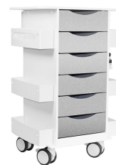
PN: 53465 Silver Metallic