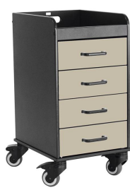
PN: 53434 Almond Beige