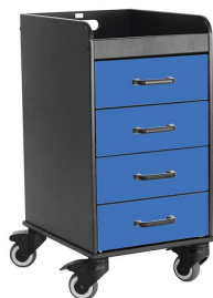
PN: 53427 Global Blue