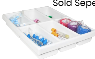
PN: 50974 6 Compartment