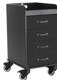
PN: 53436 Black