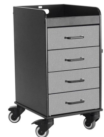
PN: 53435 Silver Metallic