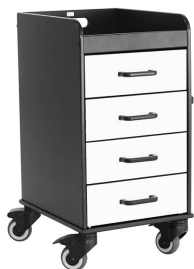
PN: 53426 White