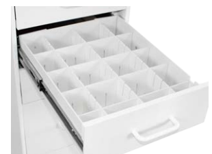
PN: 51998 Adjustable