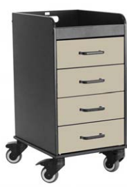
PN: 53434 Almond Beige