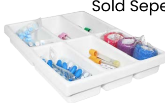
PN: 50974 6 Compartment