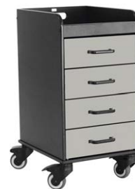
PN: 53480 Dolphin Gray