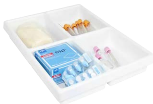
PN: 50917 4 Compartment