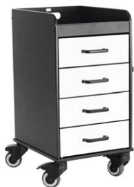
PN: 53426 White