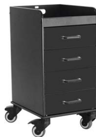
PN: 53436 Black