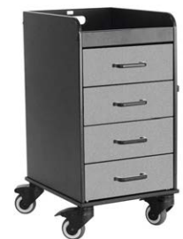
PN: 53435 Silver Metallic