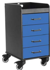
PN: 53427 Global Blue