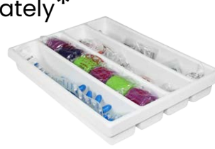
PN: 50975 4 Compartment