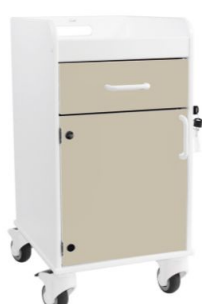
PN: 53406 Almond Beige