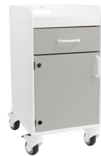
PN: 53587 Dolphin Gray