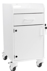
PN: 53405 White