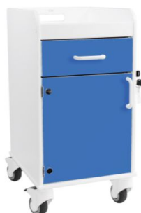
PN: 53401 Global Blue