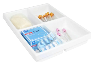
PN: 50917 4 Compartment