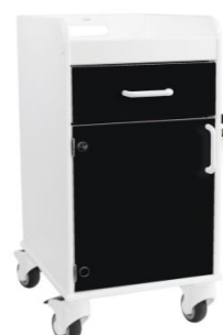
PN: 53407 Black