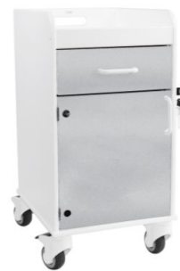
PN: 53549 Silver Metallic