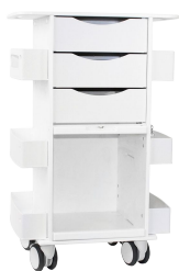
PN: 53370 White