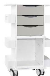
PN: 53481 Dolphin Gray