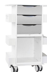
PN: 53372 Silver Metallic