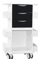
PN: 53382 Black