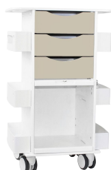
PN: 53371 Almond Beige