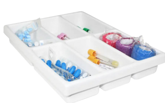
PN: 50974 6 Compartment