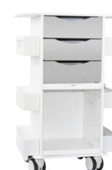
PN: 53372 Silver Metallic