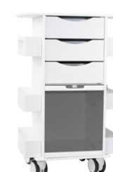
PN: 53563 Smoked Door