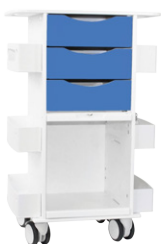
PN: 53375 Global Blue