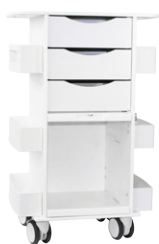
PN: 53370 White