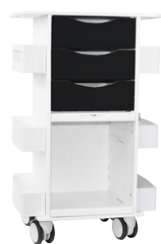
PN: 53382 Black