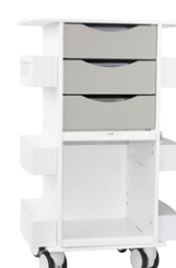
PN: 53481 Dolphin Gray