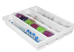
PN: 50975 4 Compartment