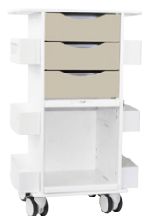
PN: 53371 Almond Beige