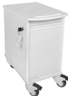
PN: 51994 White Tambour 28 lbs