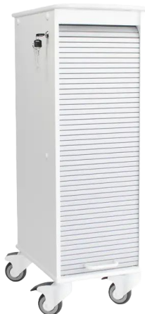
PN: 51977 Gray Tambour 52 lbs