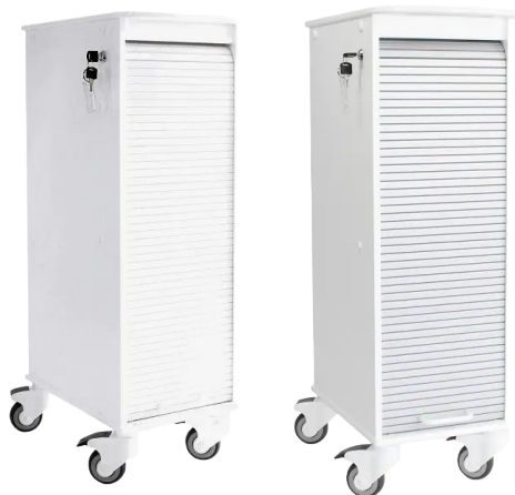
PN: 51976 White Tambour 52 lbs