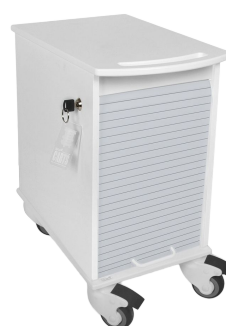
PN: 51995 Gray Tambour 28 lbs