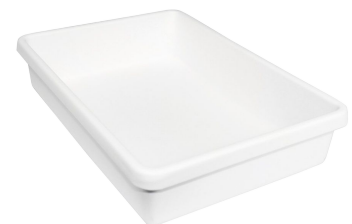
PN: 50424 Internal Dimensions: 8 3/8" x 2 3/4" x 12 1/2" (WHD)