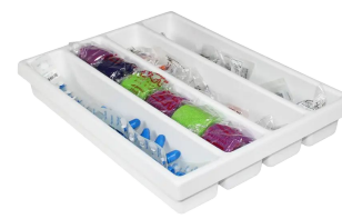
PN: 50975 4 Compartment