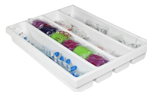
PN: 50975 4 Compartment