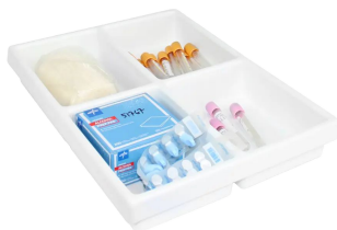
PN: 50917 4 Compartment