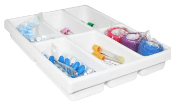
PN: 50974 6 Compartment