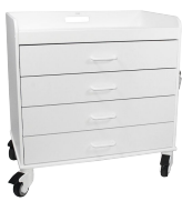
PN: 51041 White