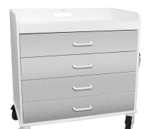
PN: 51139 Silver Metallic