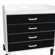
PN: 51362 Black