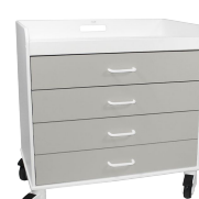
PN: 53591 Dolphin Gray