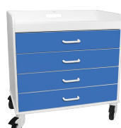
PN: 51131 Blue