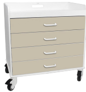
PN: 51138 Almond