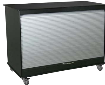
PN: 52937 Black