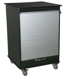
PN: 51002 Black