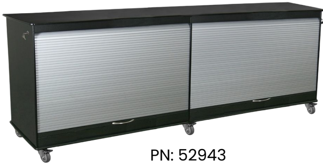
PN: 52943 Black