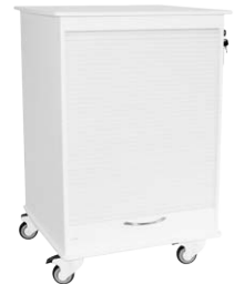
PN: 50591 White