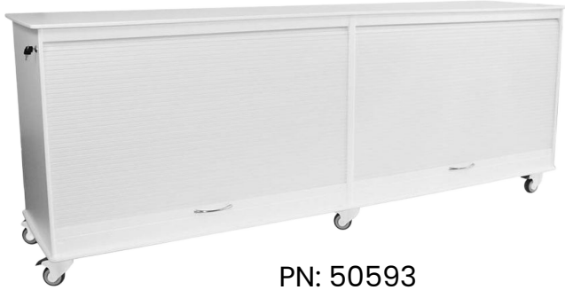
PN: 50593 White